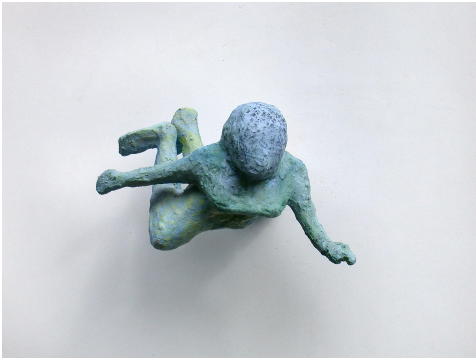
Jaqueline Shatz Diver ceramic and paint 5" x 9" x 5" 2017